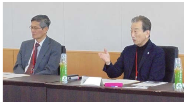
The kick-off meeting of the Hideyo Noguchi Africa Prize Committee underway