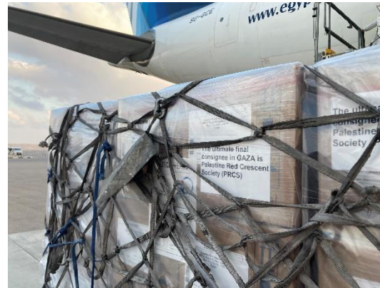
Japanese support of medical items unloaded at Al-Arish airport.