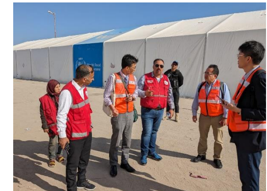
Japan tries to provide food, water, medical items and other humanitarian assistance to people in Gaza in a most speedy and efficient manner.