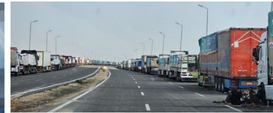
Egyptian Red Crescent warehouse in Al-Arish, where Japanese support items are checked and rearranged. Long queue of trucks carrying supports to people of Gaza in front of Rafah check point.