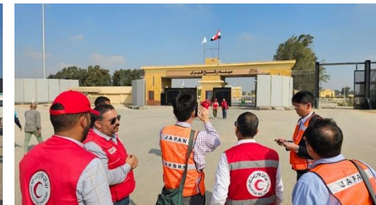
Japan and Egyptian Red Crescent team in front of Rafah check point.