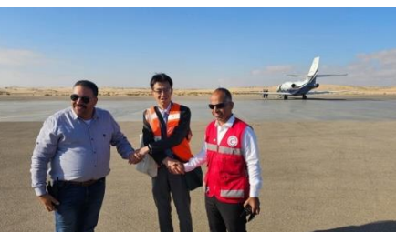
Japan and Egyptian Red Crescent hand-in-hand extend support to people in Gaza.