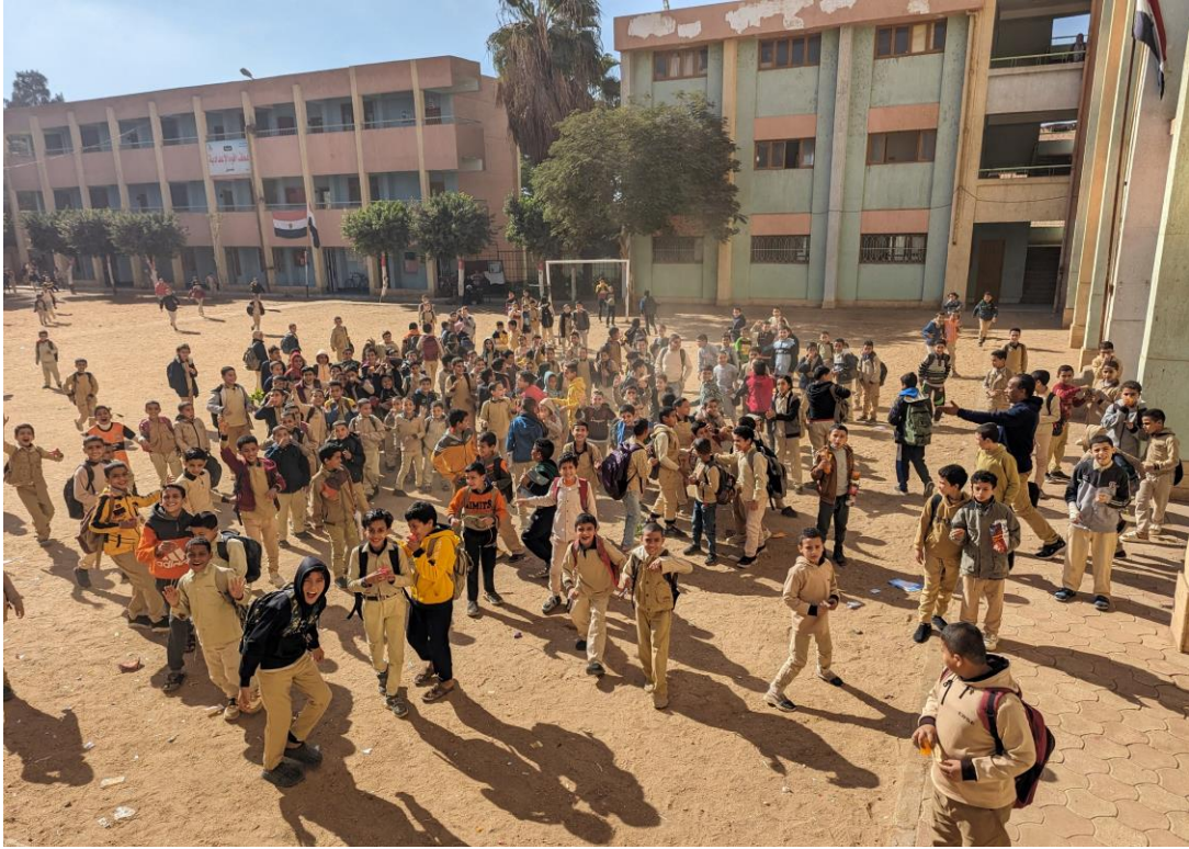
The Project for Improvement of Primary School in Wasta, Beni Suef, FY2015

“KUSANONE” grant program is provided by the Embassy of Japan in partnership with the civil society in Egypt (e.g. local NGOs, local public entities).