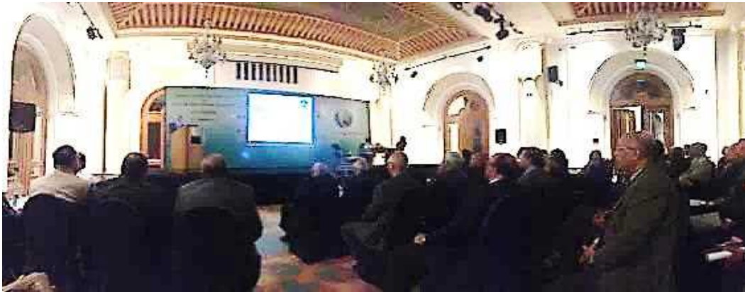
Stage, Screen and audience (image)