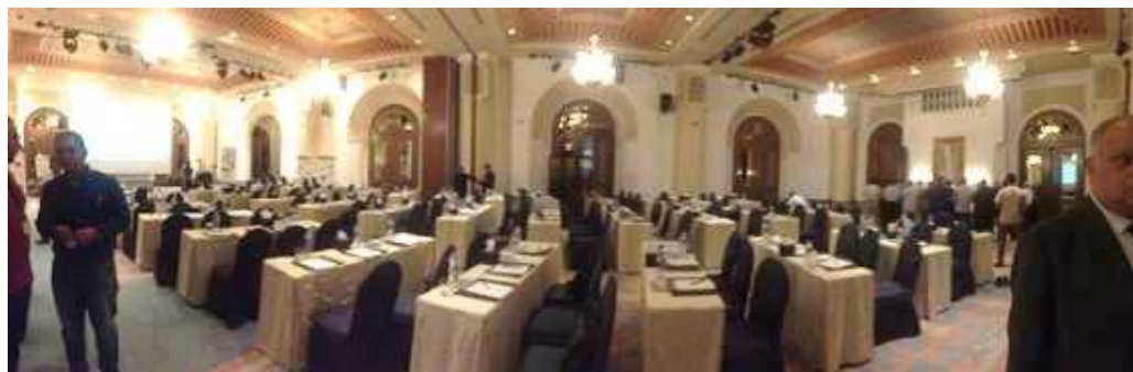
The image of the Room size of Al Hambra ballroom (*display is not totally different of this picture)