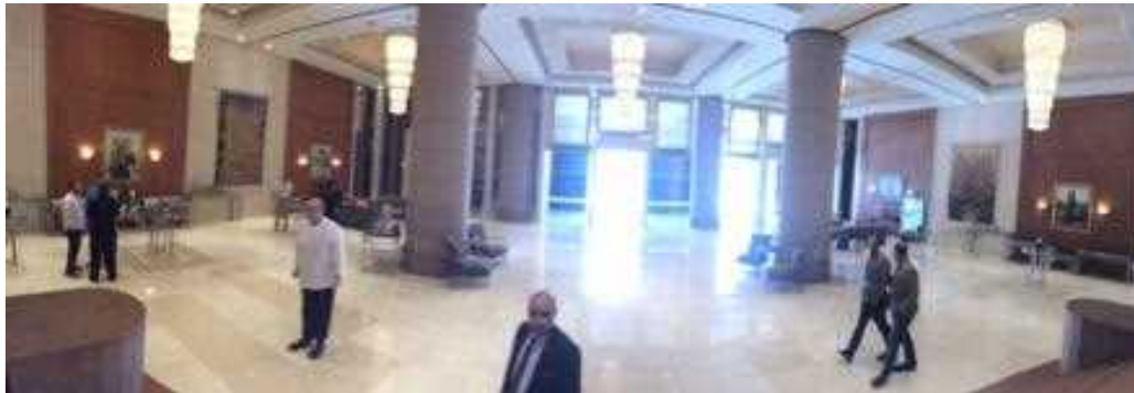
The lobby outside of the exhibition room (Poster session is available)